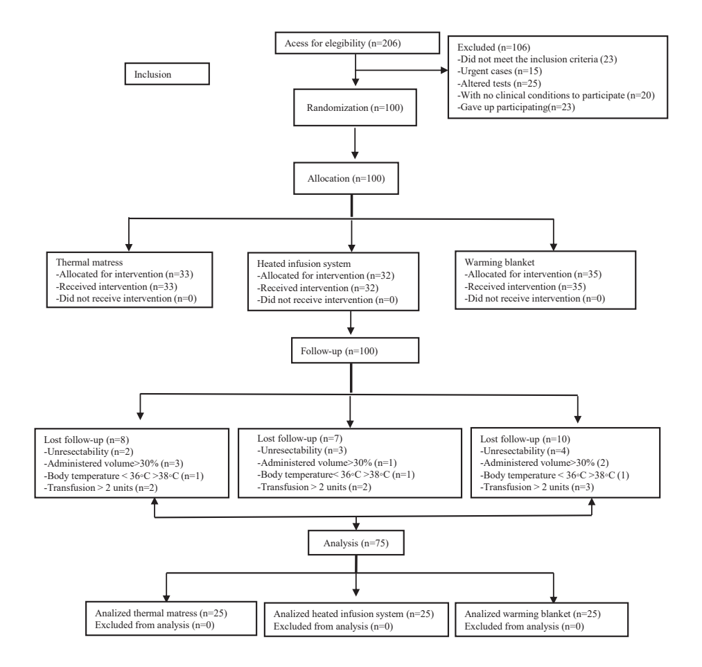
Figure 1 - CONSORT flowchart applied to this study, Campinas, SP, Brazil, 2015

The third group is the forced-air warming blanket group (GIII n = 32), with the Bair Hugger System Temperature Management Unit - Model 775 , 3M<sup>®</sup> equipment, California/USA. Patients were placed on the underbody forced-air warming blanket set at target temperature of 40-43° C, with effective heat transfer between the equipment and the blanket due to the high airflow, maximizing the patient's body surface, allowing freedom for the surgical positioning and that the heating occurred since the beginning of the procedure<sup>(6)</sup>. This product was supplied by CEI (Comércio Exportação Importação de Materiais Médicos Ltda.).