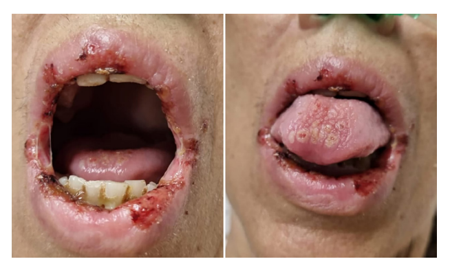
Figure 1 - Ulcerative lesions in the patient's oral cavity, on hospital admission.

Figure 1 shows ulcerated lesions in the patient's oral cavity, as observed on the day of hospitalization.