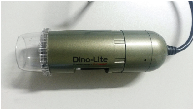
Figure 1- Dino-LiteAM4113ZT dermatoscope which features 1.3 Mega Pixel resolution and USB 2.0 interface.

the skin of the contact and a record of the Mitsuda test reaction was made by means of the software Dermatologia web (Figure 2).