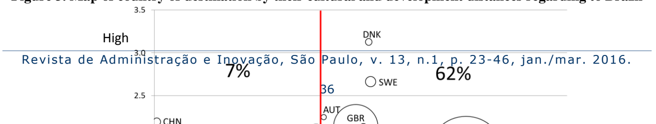
Figure 3. Map of country of destination by their cultural and development distances regarding to Brazil