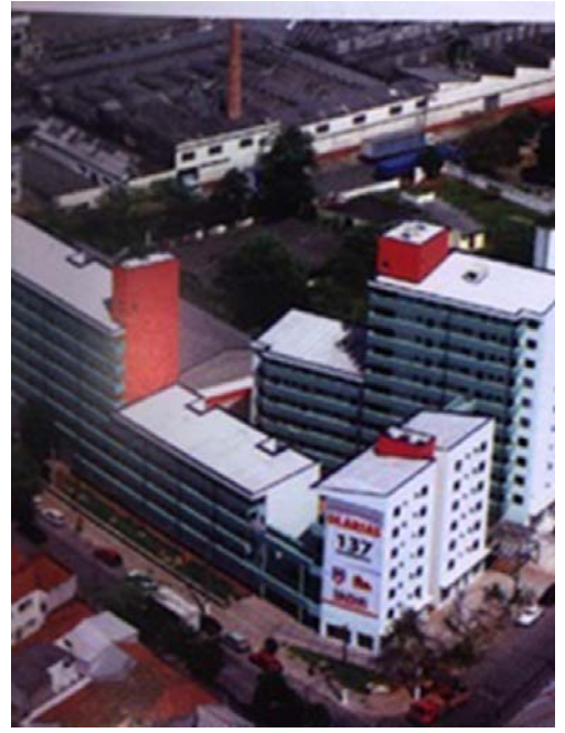
Figure 2: Olarias street large-scale residential development.