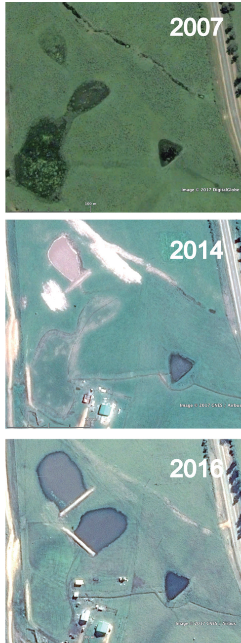
Figure 1. Sequence of degradation of a small wetland in Aceguá, Cerro Largo Department, Uruguay. Google Earth images show the state of the system in 2007, which was maintained until January 2014, when the degradation process began, and continued until 2015.

We observed 14 native anuran species in the system; 12 of them were recorded during the first two years, before the intervention (Table 1).