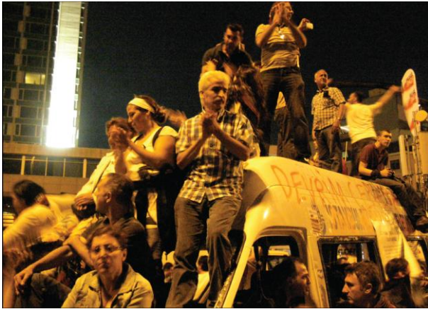
Figure 2 —Protesters in Istanbul, 2013.

If we can return to an almost religious vocabulary to continue describing this immanent experience, we would say many then experiment an epiphany. They feel another world is possible. 14 For some hours but more usually for some weeks they will share an experience that is seldom available to us. If I have defined it in quasi-religious terms it was deliberate. Each one has then an experience of a different, intuitive, instantaneous knowledge; that is epiphany or revelation. They transgress minor municipal laws; that is a matter of action. Each one knows; they act. And they have an experience of new forms of sociability; this is communion. But, even if two among the three words (epiphany, action, communion) I employed to describe these experiences come from a religious lexicon, they must be understood as experiences from immanence rather than from transcendence. It is not the revelation of a transcendent God, like the one who gave Moses the Ten Commandments. It is not the revelation some great mystics had. It is a revelation of possibilities that lie inside everyone, inside yourself. They are quite democratic and often very cheap, since they break with consumerism. Many a thing, not to say everything, seems close at hand. Millennium is imminent, it is portable, but please never forget it has a lay, an immanent character. It breaks with monotheism, with the Religions of the Book, with the traditions of the Jews, the Christians, and the Muslims.