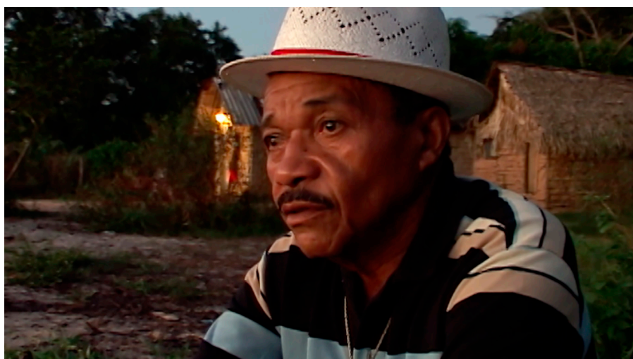
Figures 12 and 13: Main interviews of the film.