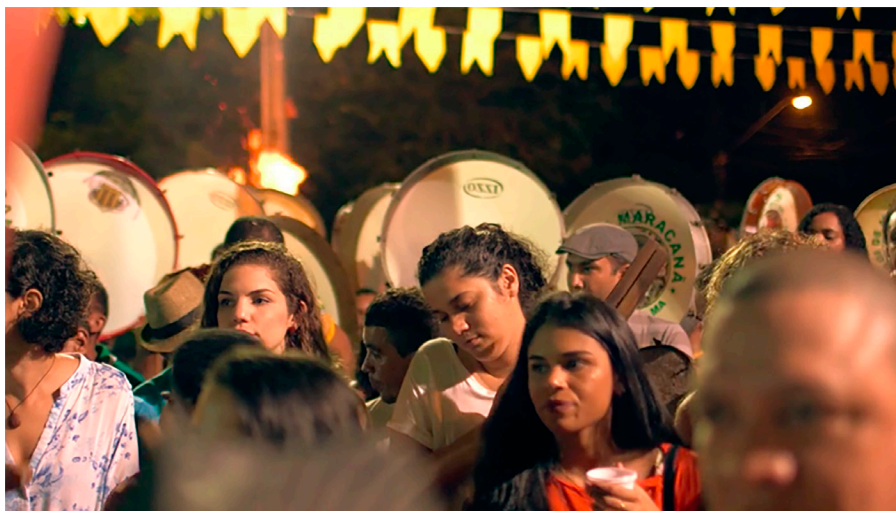
Figure 6: Boi de Maracanã's batalhão in the act of performance. Wider shots after a series of detail shots.

full), going through the religious litany until the moment when the ox guarnece (garrisons) 8 and the presentation begins.