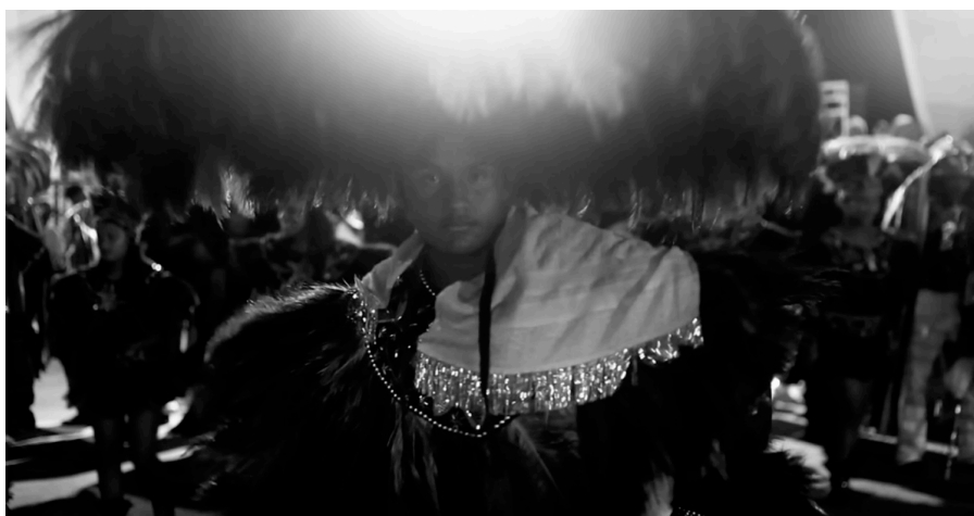
Figure 14: Black and white images as transition elements during the film.