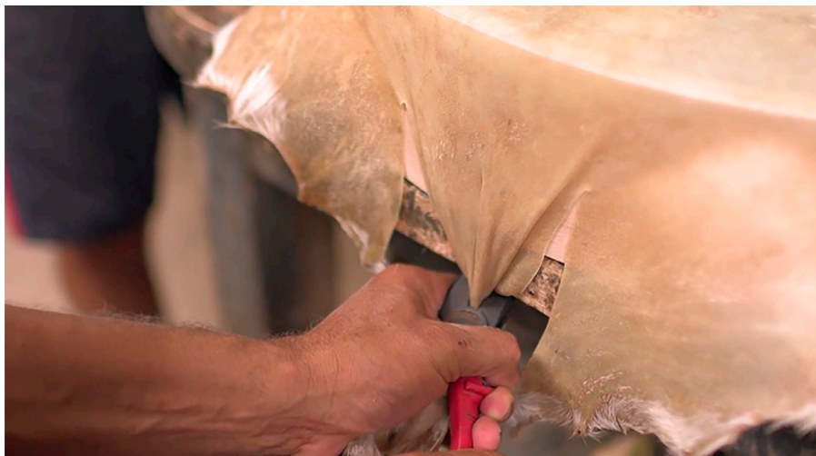
Figures 4 and 5: Close shots with selective focus. Truvão making a pandeirão .

Ribinha chants about four or five toadas during the video while talking about some bumba meu boi elements, such as the killing 7 , the day of baptism, and some characters present in this cultural manifestation. With Truvão, the viewer watches the steps that are necessary for making the pandeirão . It is also possible to see some elements of the preparation such as, for instance, members sewing costumes (close shots), the beginning of the baptism day (people arriving in several buses, the place getting