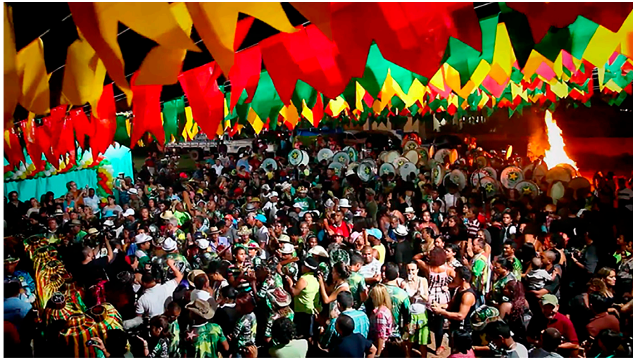
Figure 10: Establishing shot of the baptism of Boi de Maracanã.