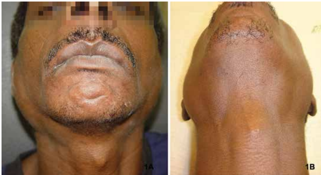
Figures 1A and B | Diffuse, bilateral swelling of the parotid and submandibular glands. There were no inflammatory signs; the swollen areas were soft on palpation.

Sialadenosis usually does not require treatment, unless for aesthetic reasons, in which a total or partial parotidectomy remains the main treatment. 1,5 In this case, no treatment was thought to be necessary. Therefore, the patient was monthly monitored by clinical examinations.