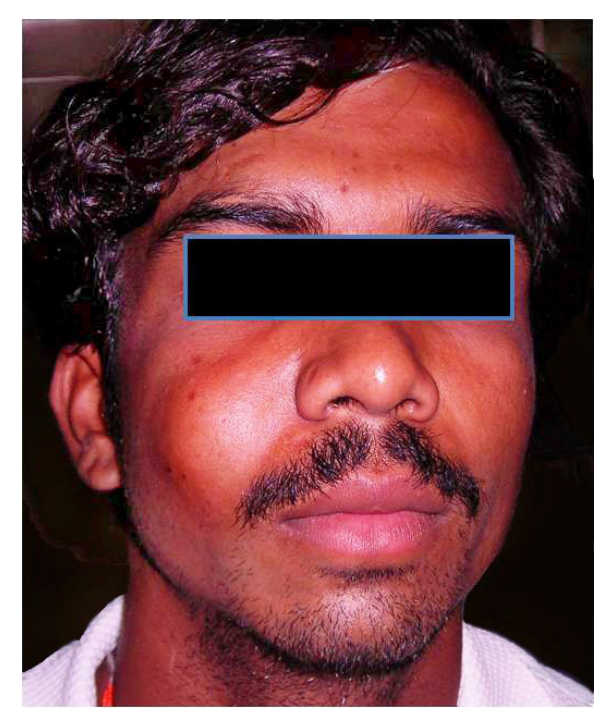
Figure 1. Extraoral (frontal) view showing a swelling over the right maxillary region.

An incisional biopsy was performed and the histopathological examination of hematoxylin and eosin stained sections revealed a cystic mass lined by a parakeratinized stratified squamous epithelium of variable thickness (four to eight cell layers). The epithelium showed a lack of rete ridges, a distinctive basal layer with palisaded and hyperchromatic nuclei, surface corrugations, and detachment from the capsule in focal areas (Figure 3A). The connective tissue capsule