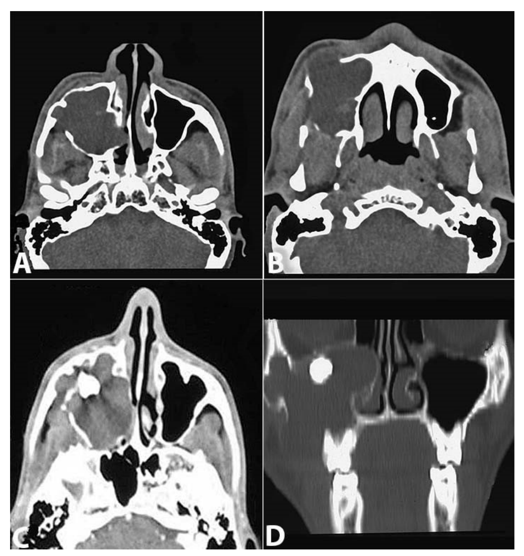
Figure 2. Axial CT of the sinuses. A - Complete opacification of the right antrum; B - Thinning and irregular destruction of the antral walls is evident; C - Displacement of right maxillary third molar; D - Coronal view showing the extensive lesion involving the right antrum and infiltrating into the right nasal cavity.