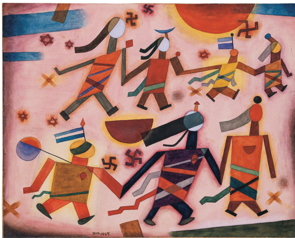
Ronda , 1925, acuarela y gouache sobre papel montado sobre cartón, 25 x 31 cm.

The name XUL, does it have something to do with Neo-Creole? Strictly speaking, the Spanish pronunciation, at least in Buenos Aires, would have to be KSUL or SUL. But it has always been pronounced with the Portuguese or Brazilian fonetization: SHUL. This is the way that we hear Borges say it. 19 It could be that, in this exercise in homophones, the name might also be an early indication of Neo-Creole, in which Spanish and Portuguese are fused. In the repertoire of esoteric signs, the X exercises a preponderantly symbolic, phonetic and religious authorial role, but it is not the only symbol to do so. In Ronda (1925) [Round], for example, several Stars of David and swastikas fly about in the space of the watercolor together with the Xs covering the bodies of seven beings walking about, this long before the swastika acquired Nazi overtones.