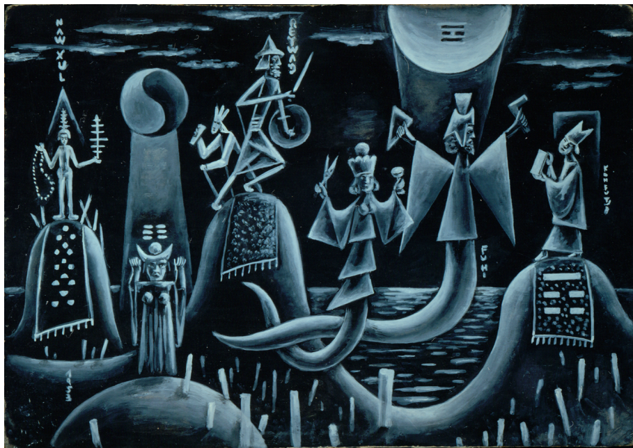
Desarrollo del Yi Ching