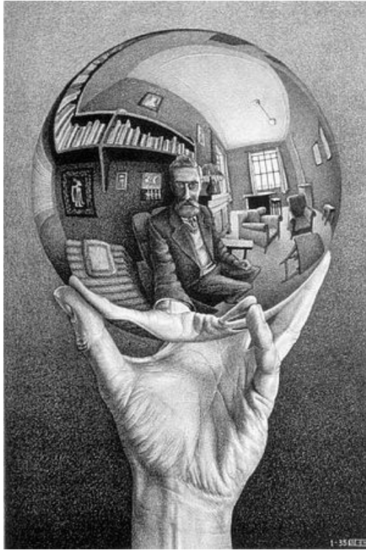
Maurits Cornelis Escher. “Hand with Reflecting Sphere” or “Self-Portrait in Spherical Mirror” (lithograph 1935).